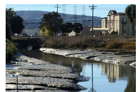
NAVIGABLE SLOUGH FEASIBILITY STUDY