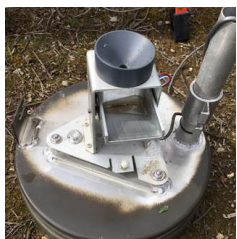
COUNTY-WIDE FLOOD MONITORING AND EMERGENCY RESPONSE PROJECT