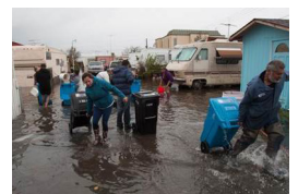
BAYFRONT CANAL AND ATHERTON CHANNEL FLOOD MANAGEMENT AND HABITAT RESTORATION