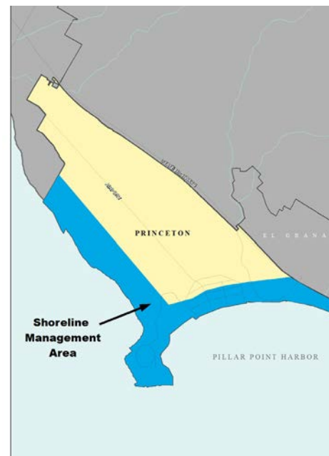
VULNERABILITIES FROM BLUFF EROSION AT PILLAR POINT BLUFF: TRAILS, HABITATS, DEFENSE FACILITY, BEACH SAFETY MANAGEMENT OPTIONS: POTENTIAL MANAGED RETREAT