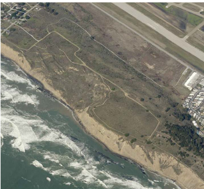
Plan Princeton Area Map