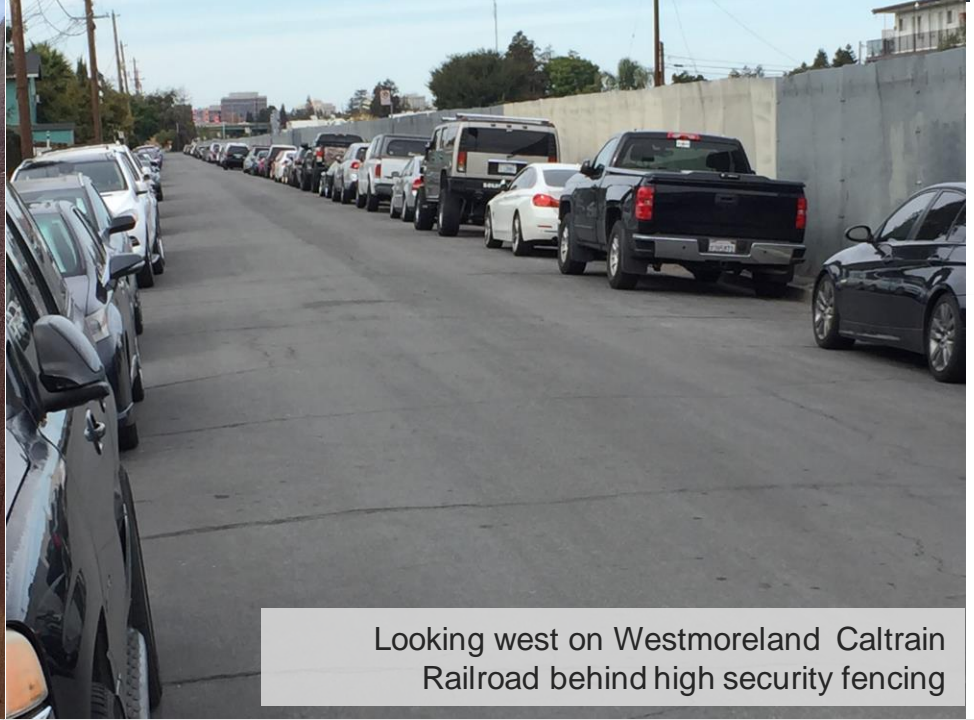
Looking west on Westmoreland Caltrain Railroad behind high security fencing