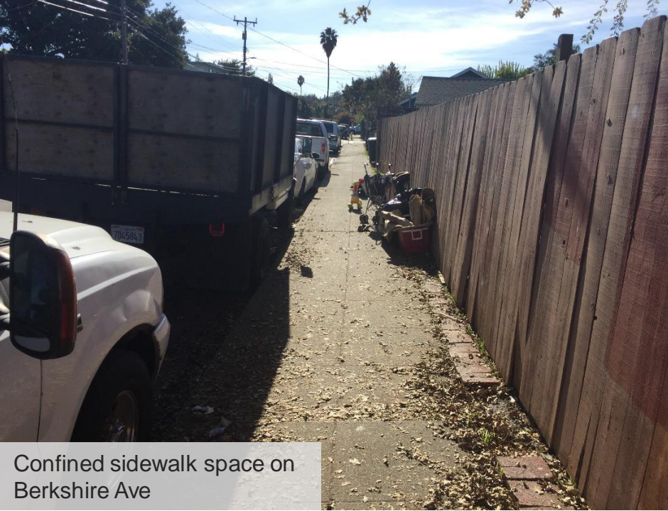
Confined sidewalk space on Berkshire Ave