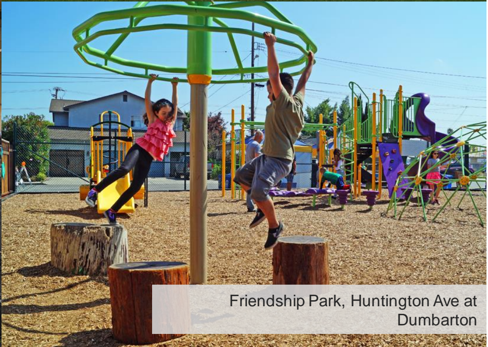
Friendship Park, Huntington Ave at Dumbarton