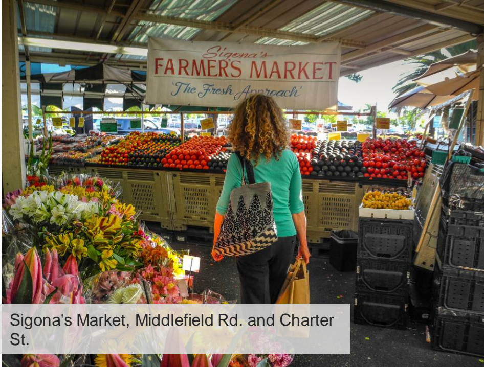
Sigona's Market, Middlefield Rd. and Charter St.