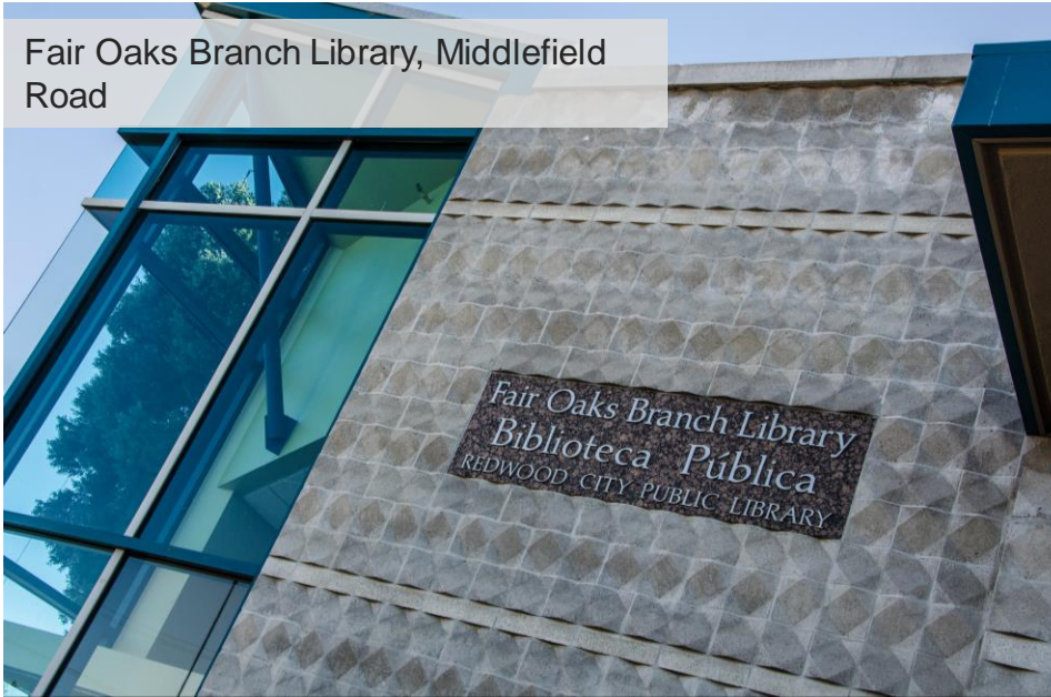
Fair Oaks Branch Library, Middlefield Road