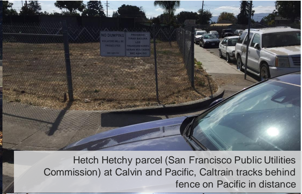
Hetch Hetchy parcel (San Francisco Public Utilities Commission) at Calvin and Pacific, Caltrain tracks behind fence on Pacific in distance