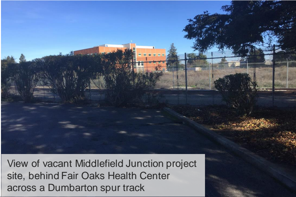
View of vacant Middlefield Junction project site, behind Fair Oaks Health Center across a Dumbarton spur track