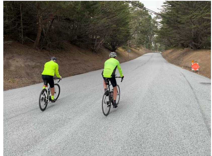
Example of chip seal project in 2022