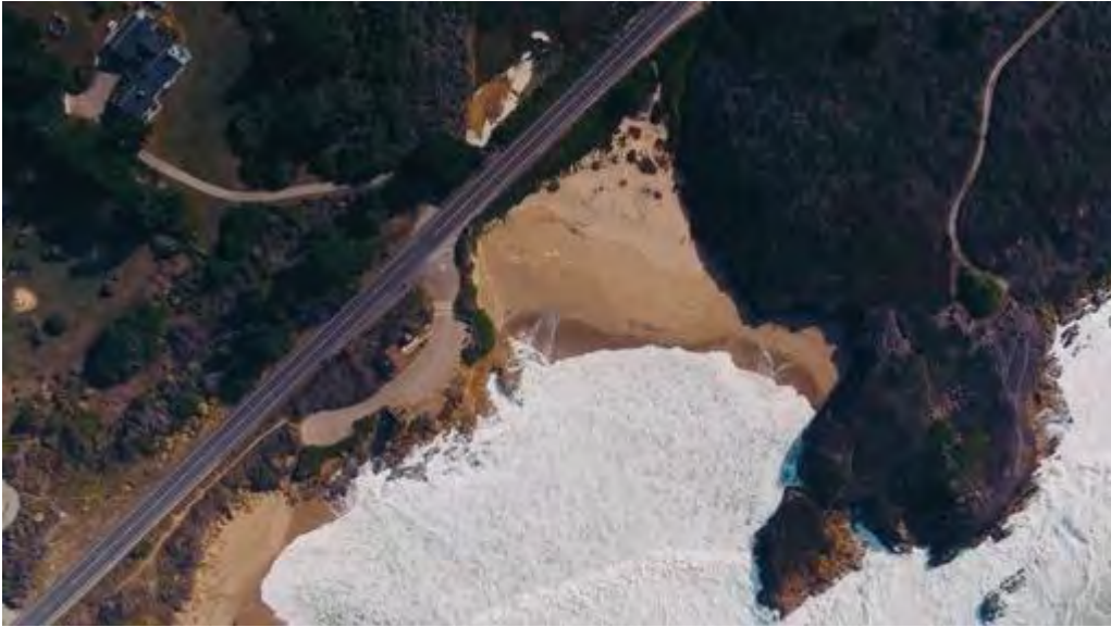
Swan Dive Media, 2021

County of San Mateo Office of Sustainability 455 County Center, 4th Floor Redwood City, CA 94063